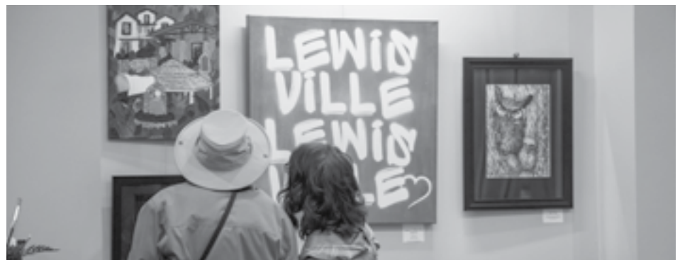
Visitors admire artwork at the 2024 winter art show