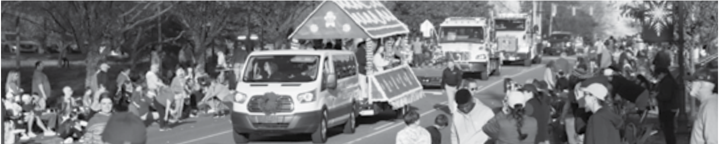
2024 Lewisville Civic Club Christmas Parade

6510 Shallowford Road, P.O. Box 547, Lewisville, NC 27023-0547 Ph. 336-945-5558