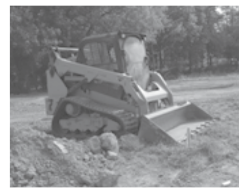
Construction Continues at Jack Warren Park

Work should be wrapping up soon on the new Jack Warren Park expansion and hopefully everyone is as excited as we are for the new opportunities. A nature trail winds through the wooded areas and will provide a relaxing and eventually informative stroll for nature lovers. An 18-hole "Ace Place" disc golf course threads through open and wooded sections, and offers a unique and exciting chal-